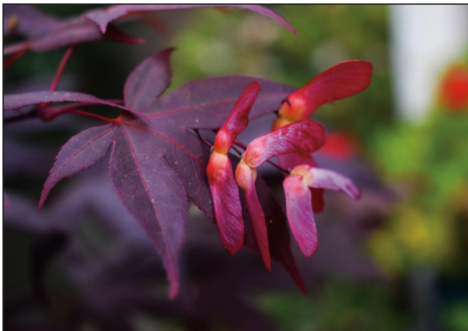
BLACK JAPANESE MAPLE

These small deciduous trees are very decorative. They are native to the eastern states, but hybridizers have developed dozens of beautiful cultivars. For