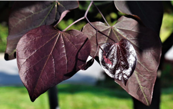
CLOSEUP OF LEAVES

The Red Bud ( Cercis canadensis ) trees are a 15 to 20 feet tall ornamental tree that are native to the eastern states and can be grown in zones 4 through 8. They were not able to thrive in New England where I grew up but were