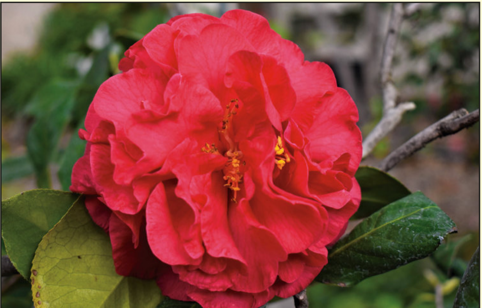
'HAROLD L. PAIGE' IN BLOOM

One of the last to bloom is C. reticulata 'Harold L. Paige'. The very large bright red rose form double to peony flower is spectacular when I finally see one blooming. A mature tree found in The Huntington Botanical Gardens can't be missed in full bloom. This wonderful flower continues to be popular and widely grown throughout the camellia world.