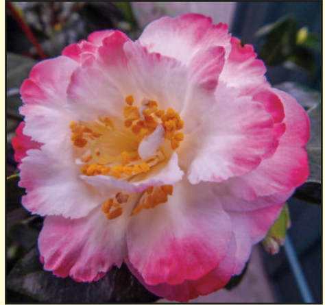
'SPRING DAZE' OPEN

'Spring Fling' has a clear bright red bloom. The name denotes that an activity is engaged in with energy and abandonment. In a romantic relationship, it may connote a short intense relationship, not unusual for spring break experience.