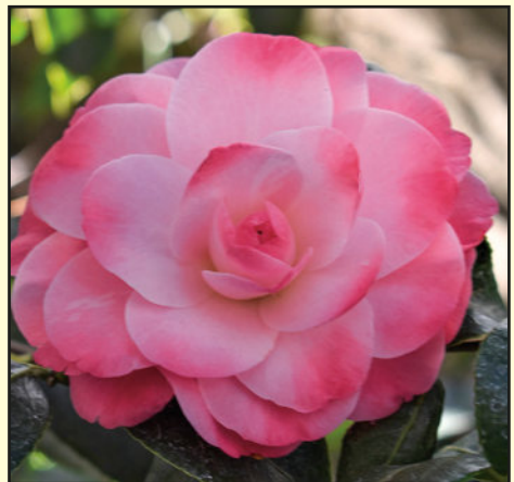
'SPRING DAZE' FORMAL DOUBLE