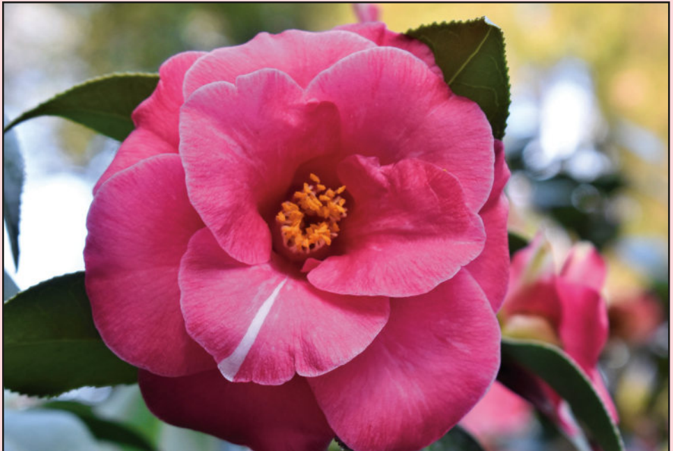
'RUDY'S MAGNOLIAEFLORA' WITH A GENETIC WHITE LINE