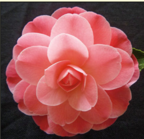
'SPRING DAZE' BUD FORM

One of the most beautiful spring blooming camellias is 'Spring Daze', which is also interesting in that it has multiple forms. Most common is the beautiful open loose peony. This photo was taken in early June.