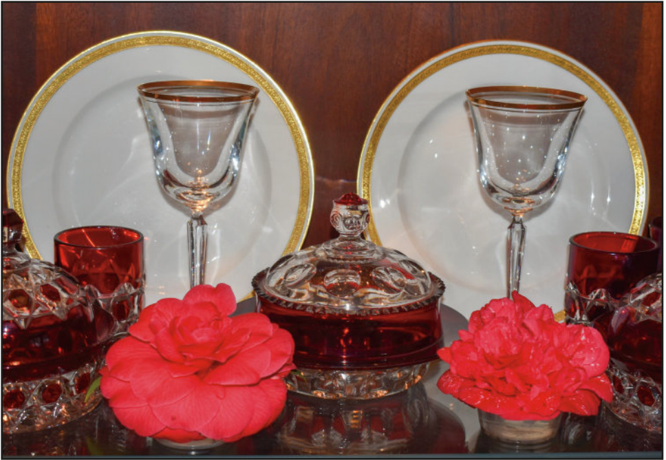
“RED BLOCK” AND “RUBY THUMBPRINT”

er collected “Red Bock,” one of the four dozen ruby-stained glass patterns produced in the 1880s and 1890s in the Pittsburgh area. When antiquing, it is more fun to be looking for something particular rather than wandering randomly in a shop. Since we both loved ruby colored glass, we started to collect “Red Block” and “Ruby Thumbprint.” The covered butterdishes look like a Kings Crown, a name used for “Ruby Thumbprint” when the pattern is clear glass.