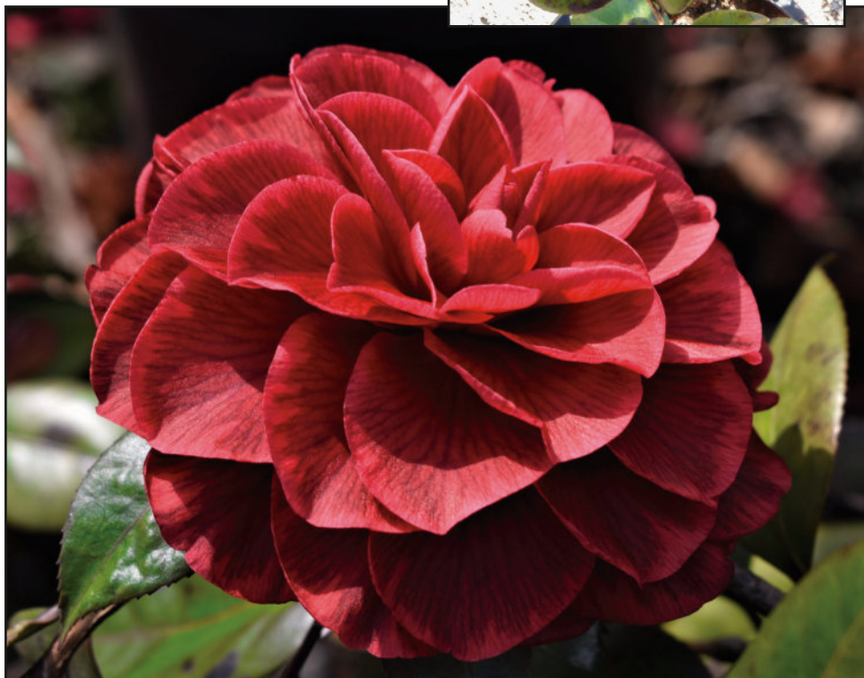
'BELLA JINHUA' AND 'BELLA JINHUA' LEAVES