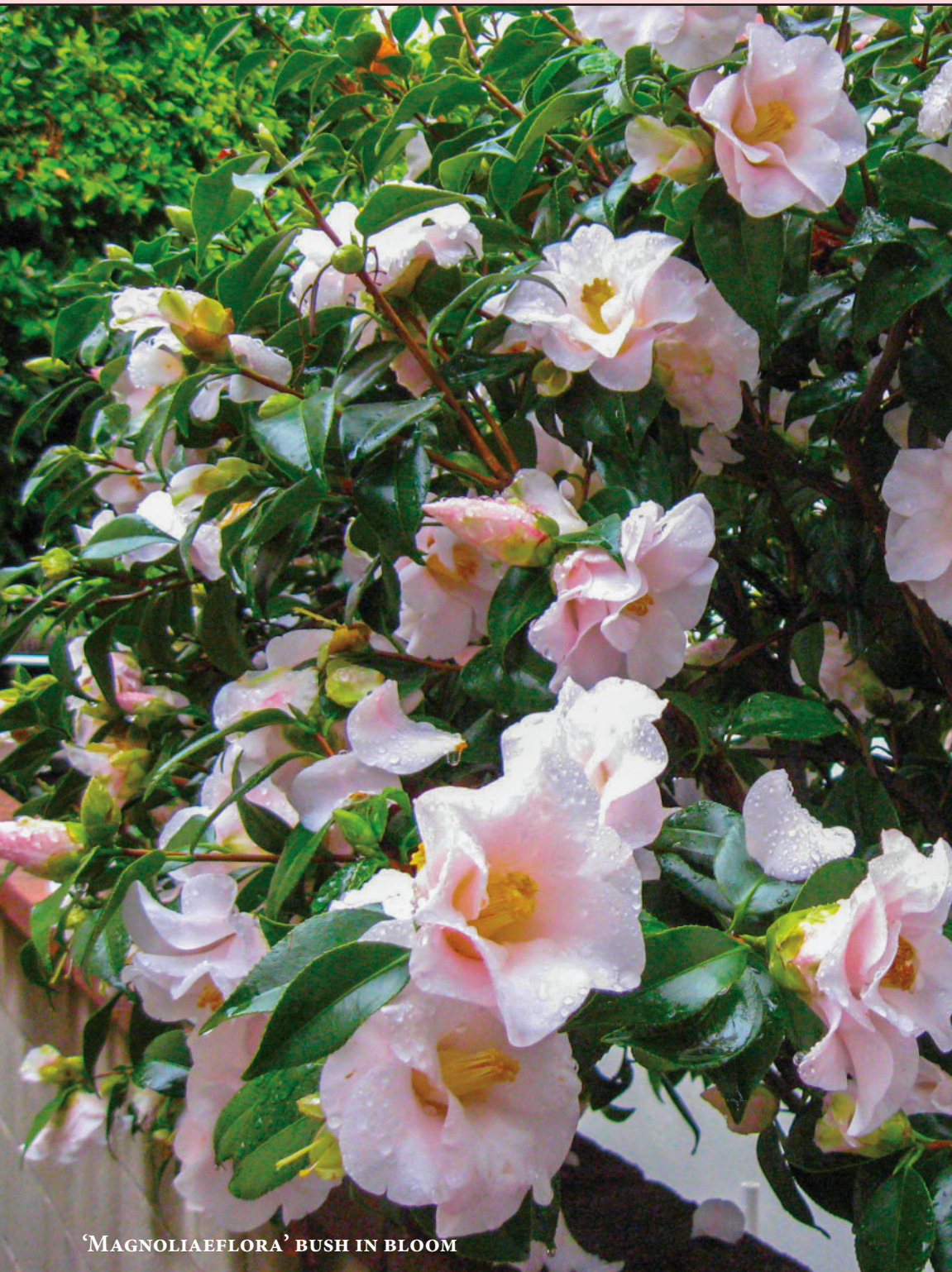
'MAGNOLIAEFLORA' BUSH IN BLOOM