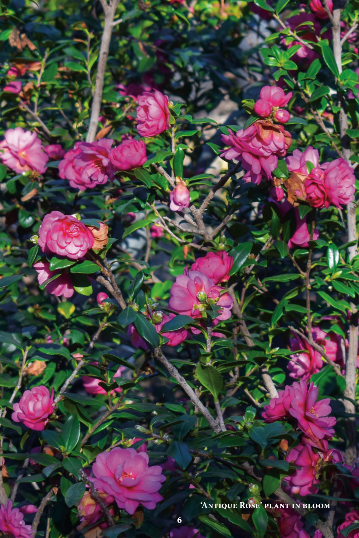
‘ANTIQUE ROSE’ PLANT IN BLOOM